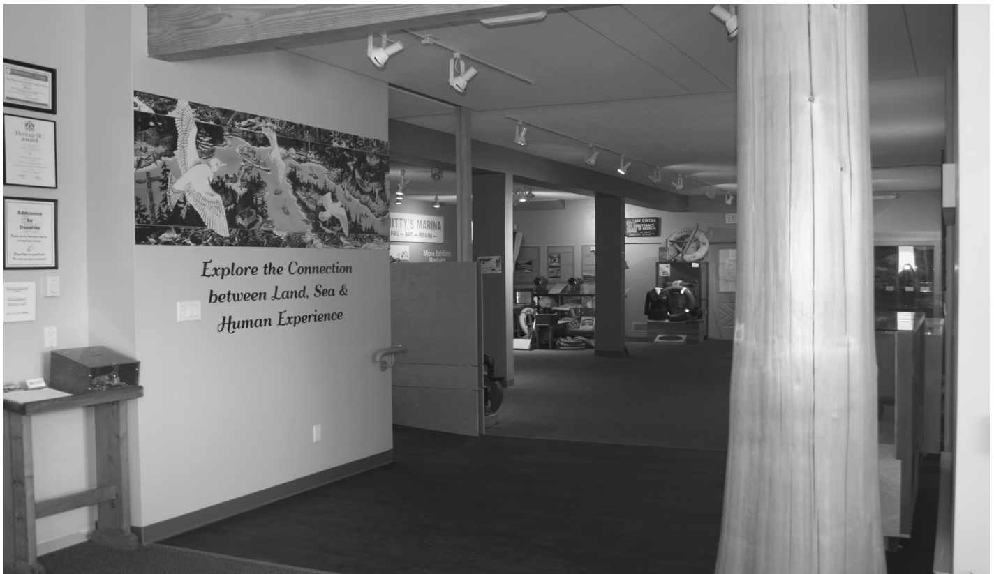
A Welcoming Experience: the Museum's new forest-themed entrance foyer

exhibit, Syets-chet Ihen-tumulh txwchelhk w-anam / Our Stories Woven through Time which was co-curated with the Squamish Lilwat Cultural Centre. The exhibit explores the deep tradition of Coast Salish weaving and features a large floor loom, two wall-mounted woven blankets and an intricately carved spindle whorl.