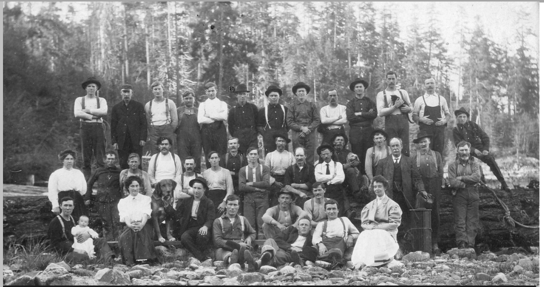
Logging Portraiture: Logging Families of the Pender Harbour area, date unknown