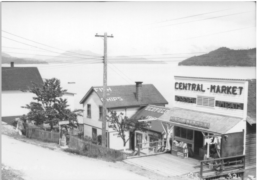
History Repeats: Central Market Delicatessen, Ogopogo Inn Fish & Chips, Gibsons, 1930s